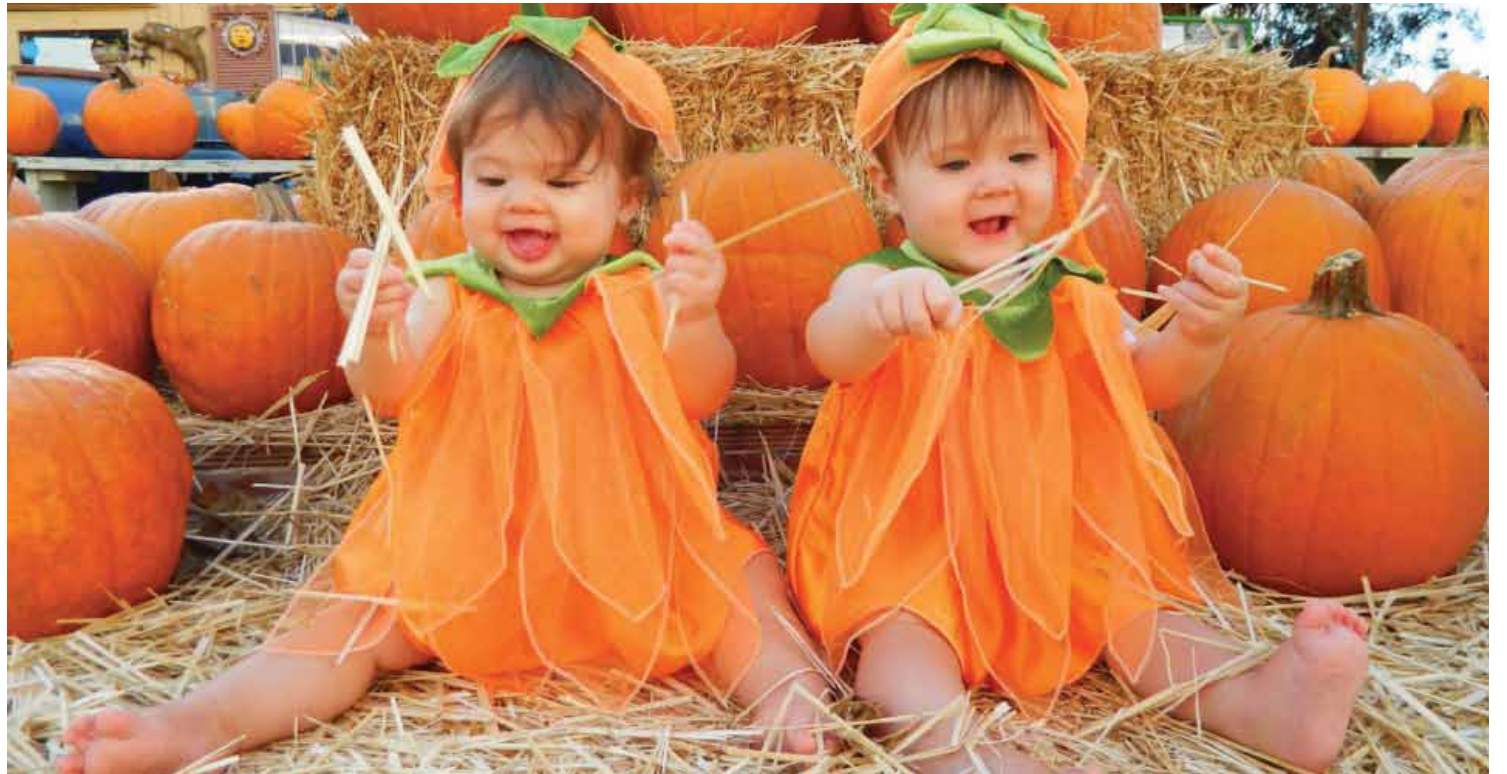
The Recreation & Parks Department will host its annual Halloween Frolic on Wednesday, Oct. 31 on the 300 and 400 Blocks of Main Street in Downtown from 4 p.m. to 7 p.m. There will be a Costume Contest for all ages, sponsored by the El Segundo Kiwanis Club, at the City Hall Plaza. There will also be a Carved Pumpkin Contest, sponsored by the El Segundo Women's Club, at the City Hall Plaza. Also available will be inflatable bounce houses, including the popular Obstacle Course, along with carnival style games for the little ones. This event is free. All ages are welcome and invited to attend. For more information or directions, interested persons may contact the Recreation & Parks Department at 310-524-2700.